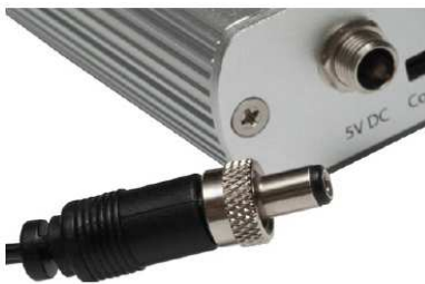
Locking Power Connector

Achievable USB 3.0 Extension by Multimode Fiber Class